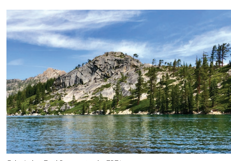
Echo Lakes Trail Restoration by TRTA

Snow plowing, signage and maintenance at the Mt. Tallac trailhead by the Tahoe Backcountry Alliance to help expand winter recreation access.