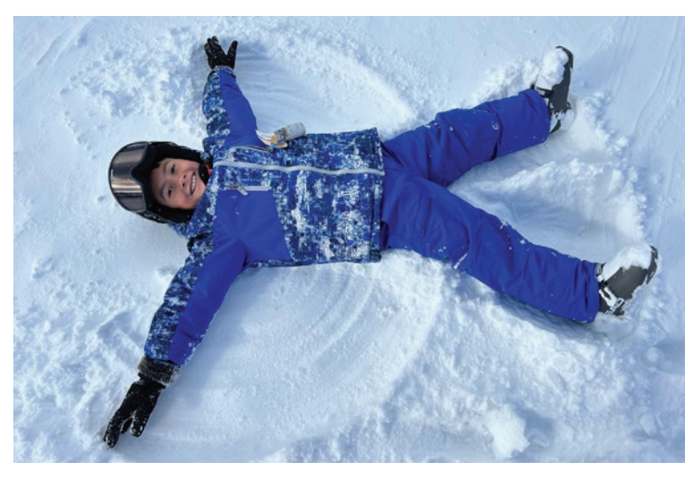
SOS Outreach Youth Mentorship Program

눚 Projects focused on access and inclusivity