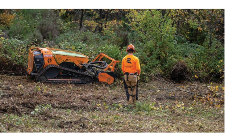
Tahoe-Truckee BurnBot Pilot